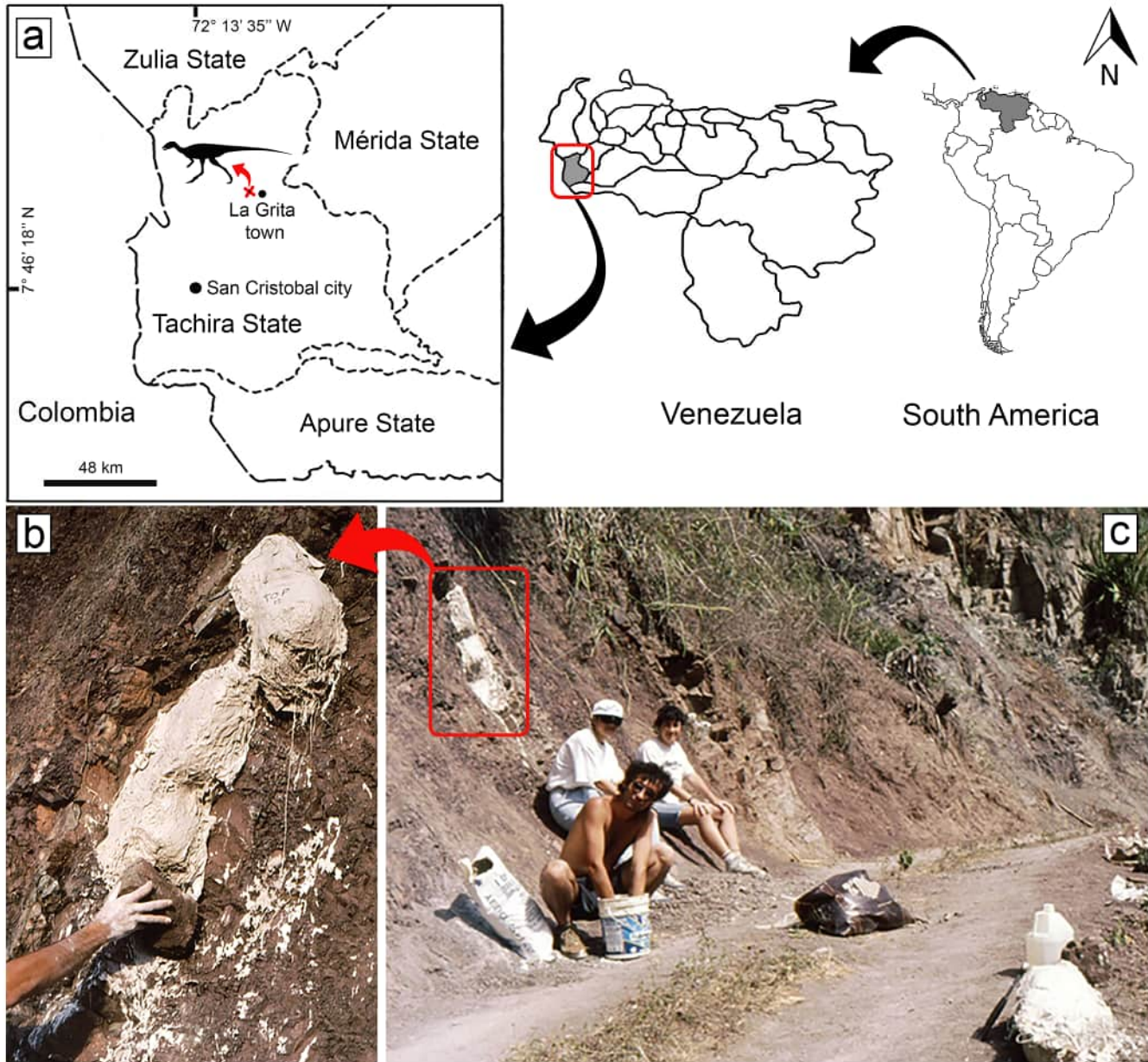
Figure 1. The La Quinta Fm. bonebed and its geographical location. a) Location map. b-c). Outcrop of the bonebed. In the picture (c), Marco Badaracco, Cathy Villalba and Sylvia Lim in the bonebed in 1993.

Seboruco, Táchira state (Fig. 1). This bonebed is characterized by a medium to poorly sorted sandy siltstone with angular to sub-angular clast and pebbles (Moody 1997). The bonebed section is located directly opposite the type section of the La Quinta Fm. (Schubert et al. 1979, Schubert 1986), possibly separated by one or more faults (Russell et al. 1992, Moody 1997, Barrett et al. 2008). Because of this faulting, precise stratigraphic placement of the bonebed has been difficult, with interpretations ranging likely from the middle to upper portion of the La Quinta Fm. (Barrett et al. 2008). Dating based on U-Pb zircon analy-